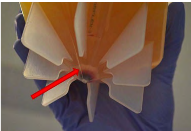
Figure 1. GID SVF-1 device (Louisville, CO) with concentrated cell pellet.

Once the patient emerged from general anesthetic, the patient was transferred from the operating table on to a